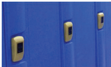
RFID (DIGITAL) LOCK