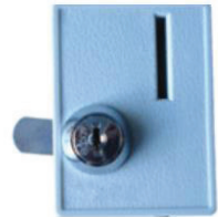
COIN RETURN LOCK