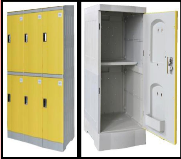
DOUBLE TIER LOCKERS