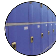
RFID (Digital) lock