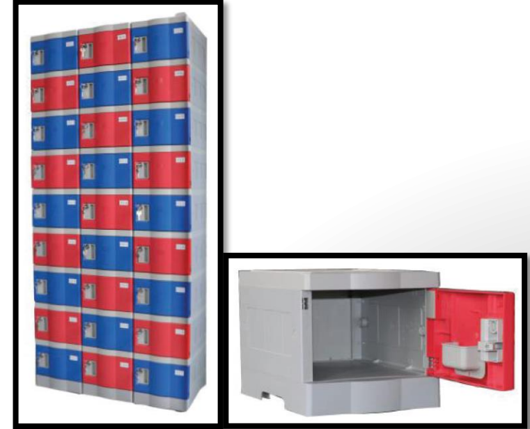
NINE TIER LOCKERS